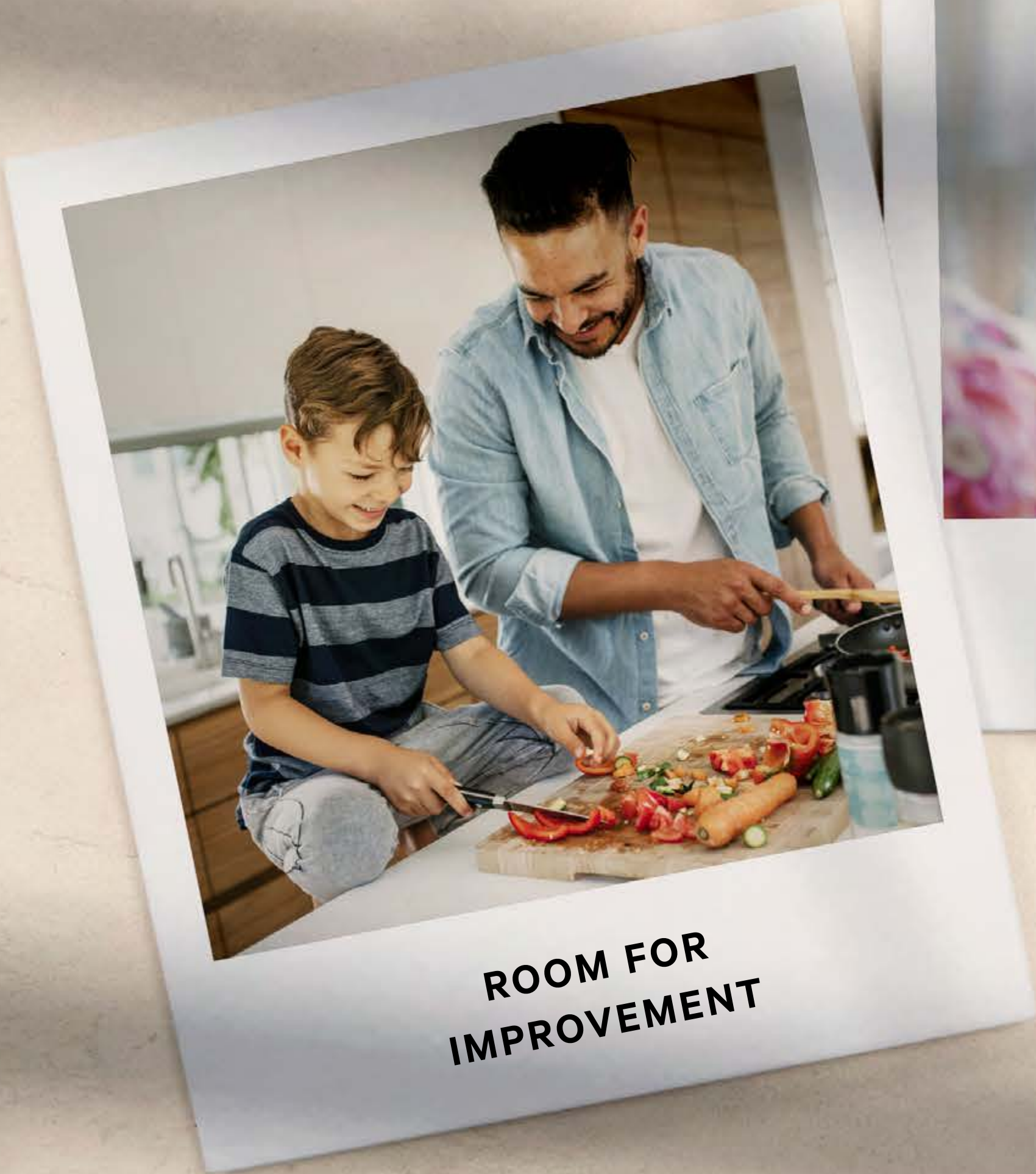
ROOM FOR IMPROVEMENT