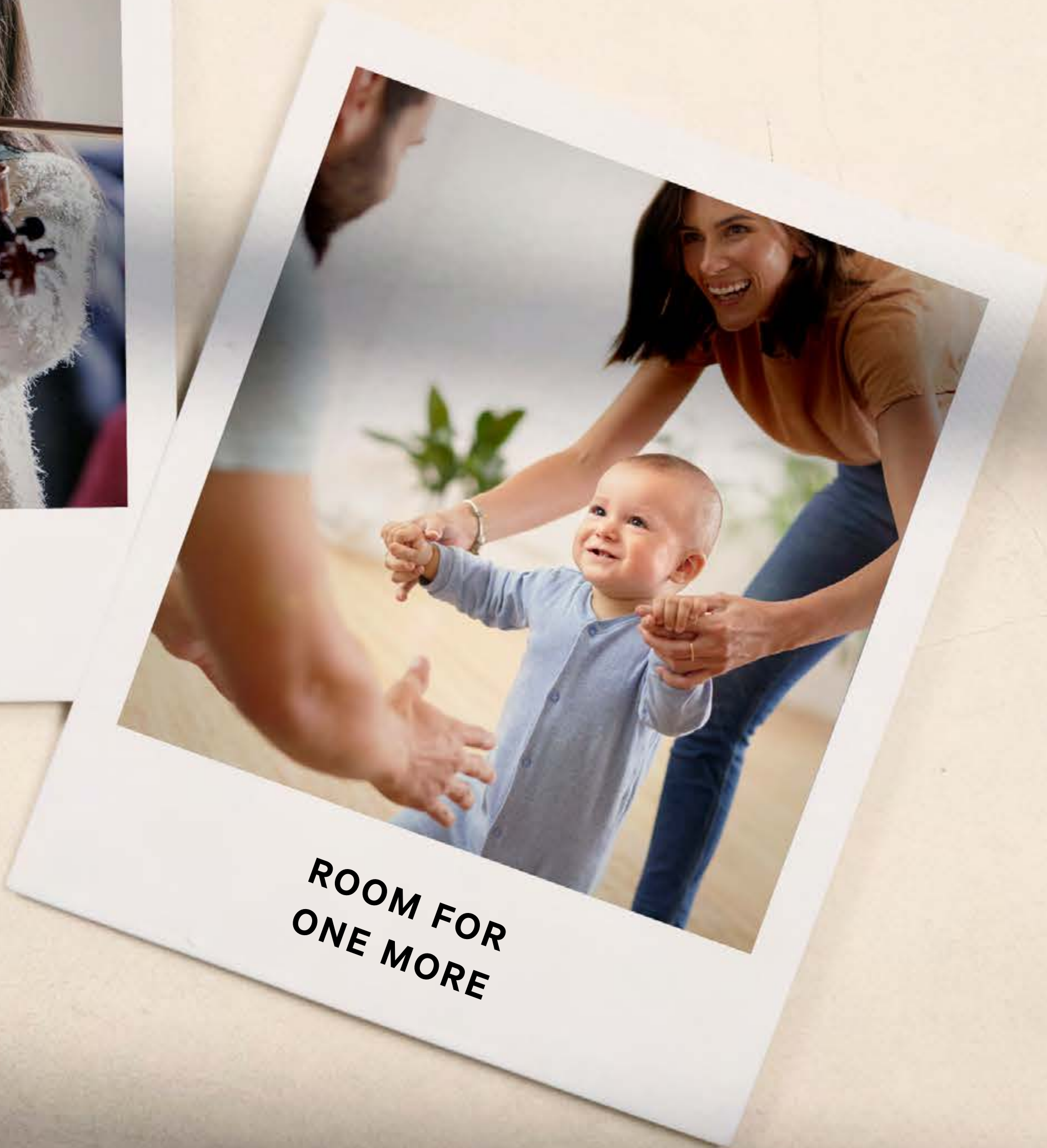
ROOM FOR ONE MORE