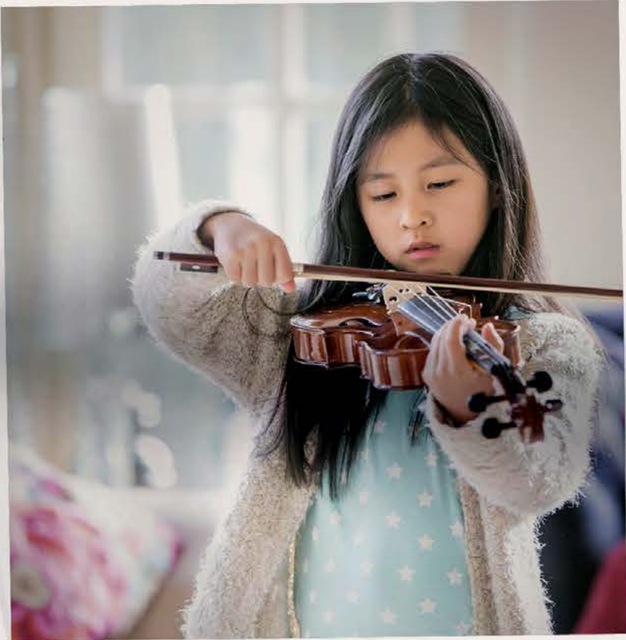
MORE ROOM FOR GROWTH